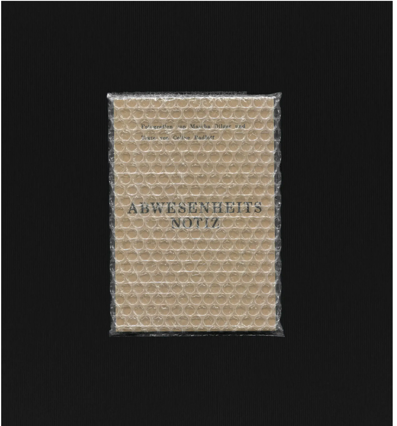
PRODUCT FRONT VIEW